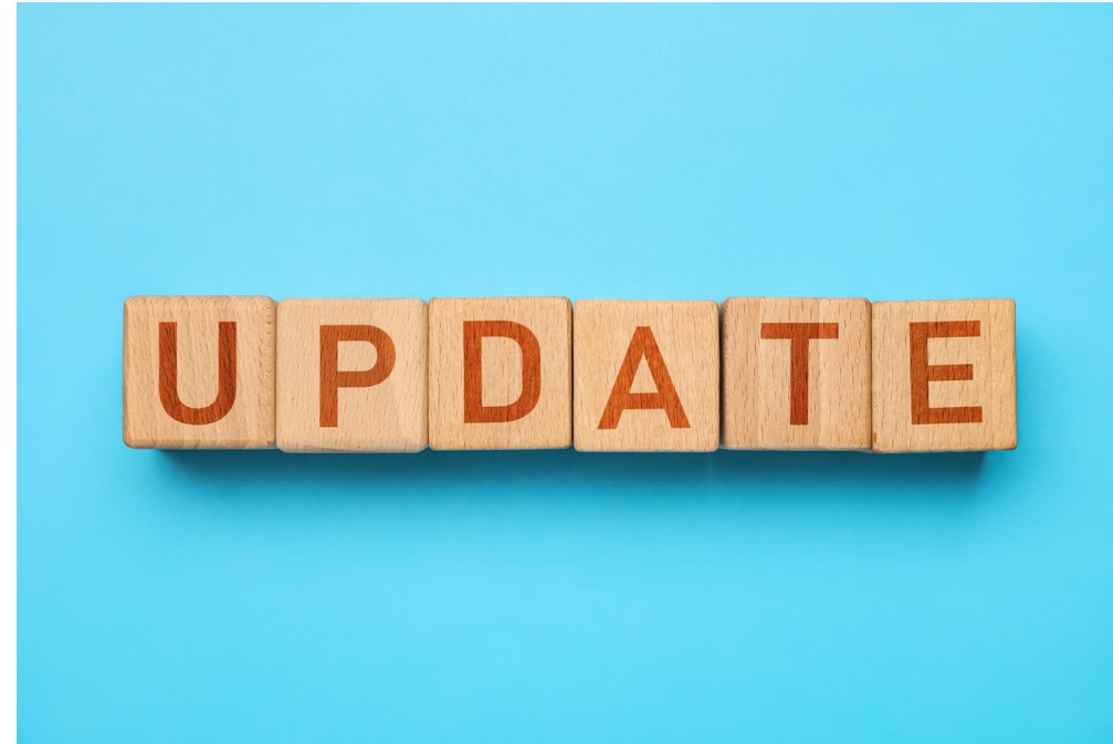
Upgrade Legacy Systems