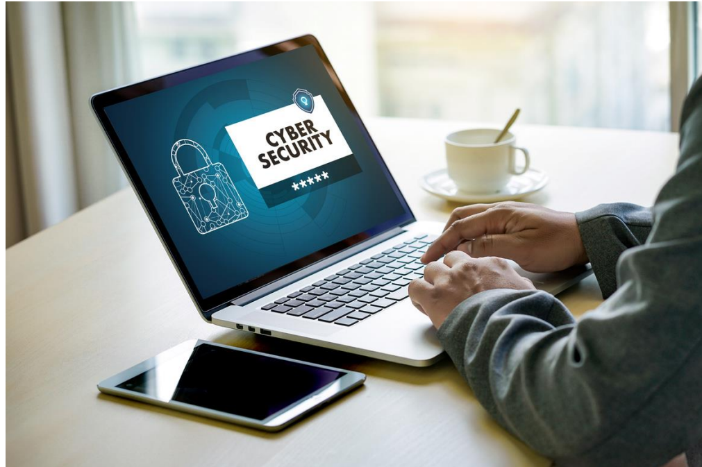
Regular Cybersecurity Training