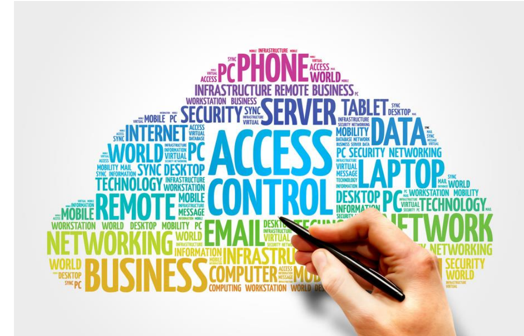
Strict Access Controls